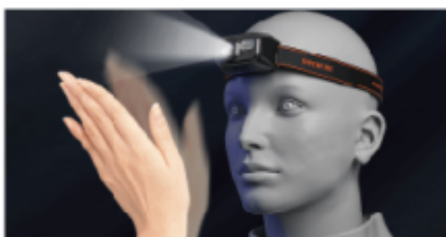
Hand wave sensor demo

Press the left induction button to turn on the induction function, the induction indicator lights up, you can wave your hand to turn on the light within 10cm, click the right button to adjust the mode normally, and continue to press the induction button to turn off